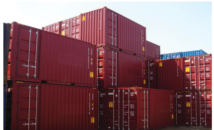
Containers waiting for delivery to our customers