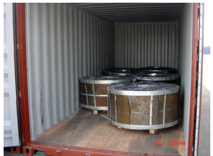
Cold rolled Steel coils arriving in India

This quarter began with steel markets being in a positive mood. Due to increase in demand, Indian producers recorded higher crude steel production during this quarter ranging from about 10-12% more output in different products compared to last quarter. However, the positive sentiment and expectations of a price rise were soon dimished largely due to global economic fears, increasing interest rates in India and a seasonal slowdown due to monsoons. What also had a material impact is the terrible high price of iron ore domestically owing to closure of most operating mines.