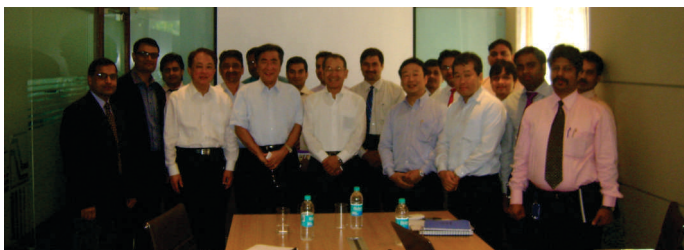
The leadership teams of Magnum and Brother International at Sara House

In the last quarter, the top management of Brother International Singapore Pte Ltd and of Pegasus Singapore Pte Ltd visited Magnum offices to discuss in detail the future business strategy for Brother & Pegasus machines. With the fast increasing customer base & in line with our constant endeavor to strengthen our after sales service network Magnum has now started monthly training programs for customers and service engineers. With a new branch office in Kolkata, Magnum in the last quarter has seen increase in its business from the East India market.