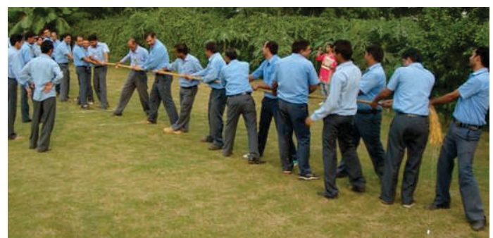
Tug of war at Sara Textiles

The entire team at the plant was invited to participate and have fun in the various activities like: relay race, kabbadi, musical chairs and tug of war to refresh the memory of childhood days. Everybody was full of enthusiasm which could be felt by the hooting done by the supporting audience.