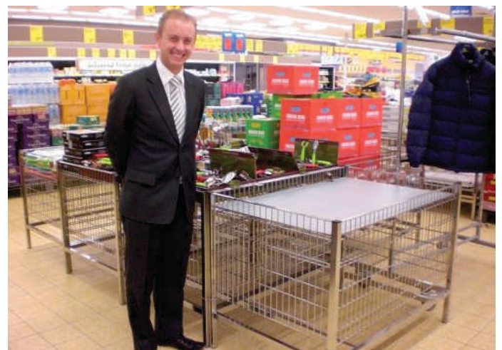
Visiting the stores of our Australian customers

The last quarter has seen positive movement with a trip to Australia to meet with a new customer and explore opportunity of Sara Intl Ltd. partnering with