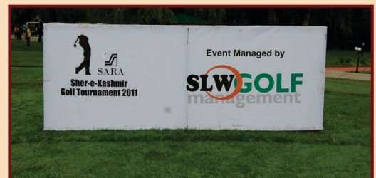
Sara "Sher-E-Kashmir" Golf Tournament

Sara Group was the proud lead sponsor for the "Sher-E-Kashmir" Golf tournament in Srinagar at the Royal Springs golf course. The tournament was the first of five annual golf tournaments that Sara plans to host in association with the Jammu & Kashmir government. The event was a roaring success with participants from industry and the Indian bureaucracy having a fantastic day. The tournament held at one of the most breathtaking golf courses in India if not the world saw participation of over 70 golfers who traveled with families for three days to Srinagar. The tournament, aptly named after Shri Sheik Mohammed Abdullah or commonly know as the Sher-E-Kashmir (The Lion of Kashmir) saw Dr. Farooq Abdullah (Union Minister for New and Renewable Energy) tee off the tournament with a splendid drive from Tee number one. In a first, number of white doves were released before the commencement of the tournament to mark the occasion and signal for peace in the state of Jammu & Kashmir.