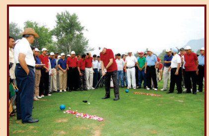
Dr. Farooq Abdullah teeing off the tournament